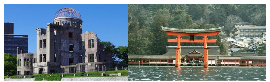
Atomic bomb dome

Hiroshima is known for the home of two world heritages, the Atomic Bomb Dome and the Itsukushima-Jinja (Shrine). Here you will also find other Japanese traditional spots such as Hiroshima Castle, in combination with the Japanese modern cultures. The local foods such as "Hiroshima-Kaki" (oyster) and "Okonomi-yaki" are among those items that cannot be missed.